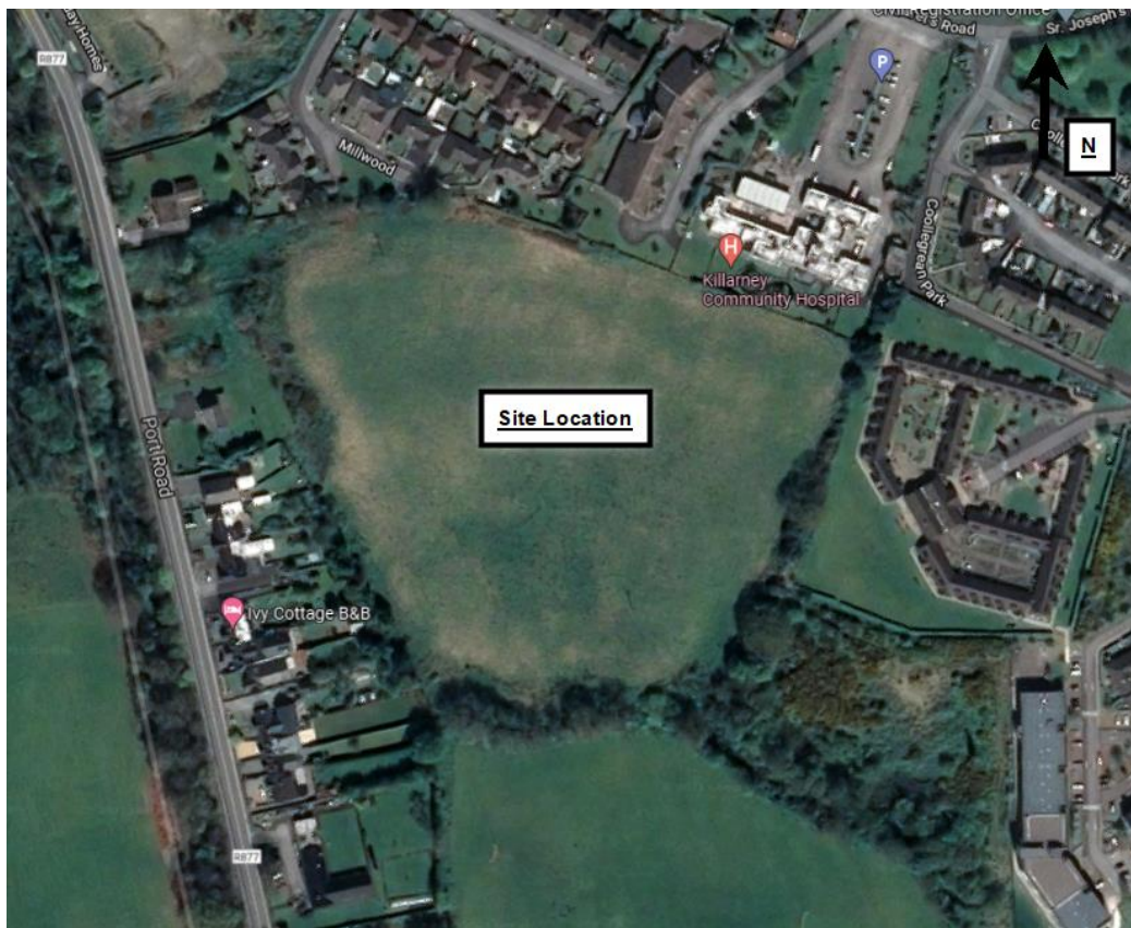
Figure 2 – Site Extents